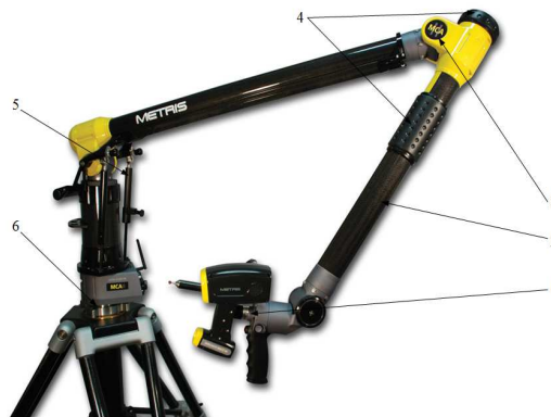
Fig. 1. Coordinate measuring arm.

Studies were performed using a Metris Nikon Metrology Series MCA II [7] coordinate measuring arm which is in the equipment of the laboratory of the Institute of Metrology and Biomedical Engineering of Warsaw University of Technology (Fig. 1). This is a seven-axis portable measuring device designed to work in the environment of production, in laboratories. Because of applying a rechargeable battery and wireless communication it can also be used outdoors.